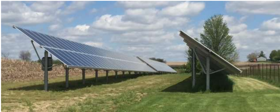
Figure 1 - The 75 kW solar energy system, positioned between a field and sheep pen.

Margaret recommended keeping track of production values and credits, and to communicate more with the utility, especially the utility's solar energy department, to work through any questions or concerns throughout the process.